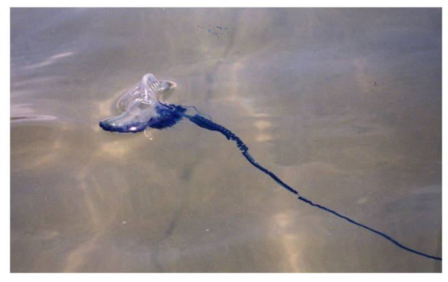
Fig. 3 Portuguese man-of-war.

tentacles form swollen welts that appear as a linear papular rash.