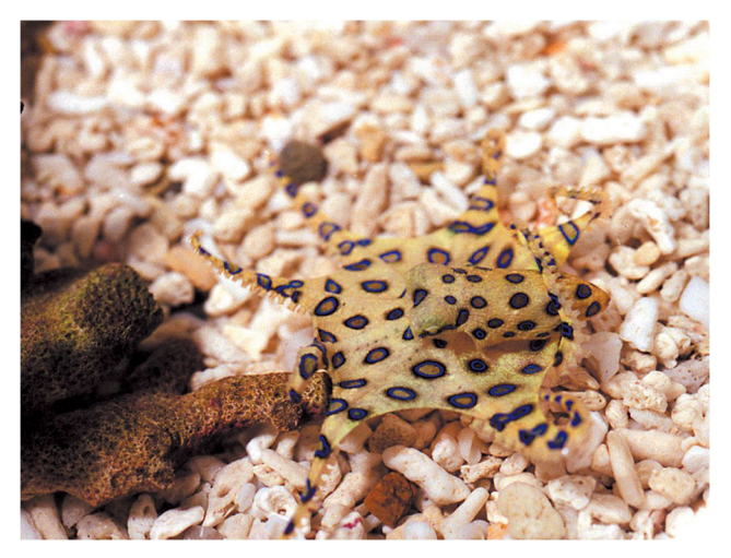
Fig. 5 Blue-ringed octopus.

Epidemiology : H. fasciata is most commonly found around intertidal rocky shores and coastal waters between Australia and through the Pacific Ocean north to Japan.