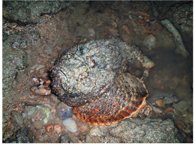
Fig. 2 Stonefish.

Venom activity and clinical symptoms : Fatalities resulting from reef stonefish stings have been reported in Okinawa prefecture. These injuries may have been sustained