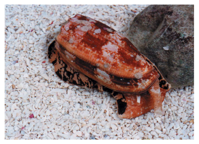
Fig. 4 Geography cone.

Diagnosis: Currently, there are no definitive diagnostic criteria for geography cone envenomation. The diagnosis is based on the patient's history or the positive identification of the geography cone presented by the patient.