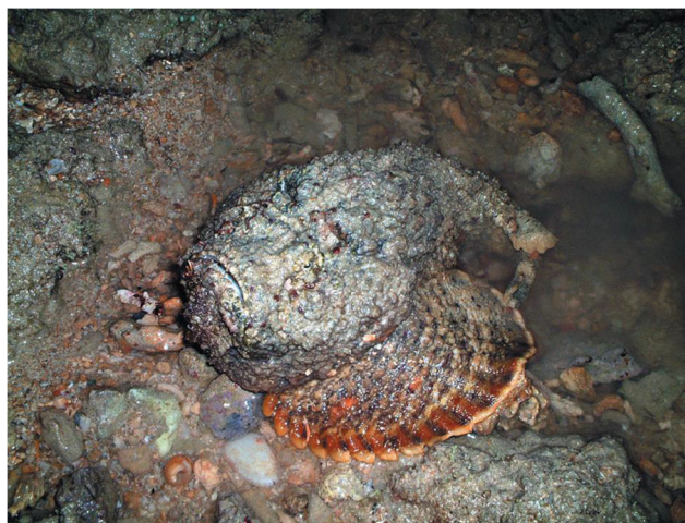
Fig. 2 Stonefish.

Venom activity and clinical symptoms: Fatalities resulting from reef stonefish stings have been reported in Okinawa prefecture. These injuries may have been sustained