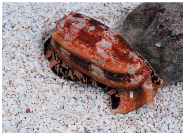
Fig. 4 Geography cone.

Diagnosis: Currently, there are no definitive diagnostic criteria for geography cone envenomation. The diagnosis is based on the patient's history or the positive identification of the geography cone presented by the patient.