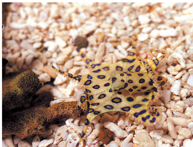
Fig. 5 Blue-ringed octopus.

Epidemiology: H. fasciata is most commonly found around intertidal rocky shores and coastal waters between Australia and through the Pacific Ocean north to Japan.