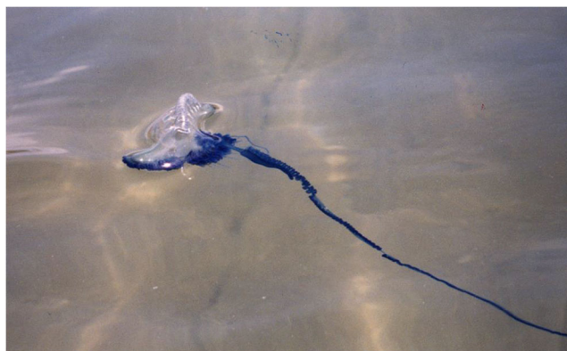
Fig. 3 Portuguese man-of-war.

tentacles form swollen welts that appear as a linear papular rash.